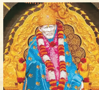
Sai Baba (Shirdi)