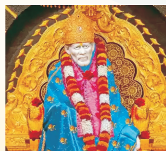
Sai Baba Mandir (Shirdi)